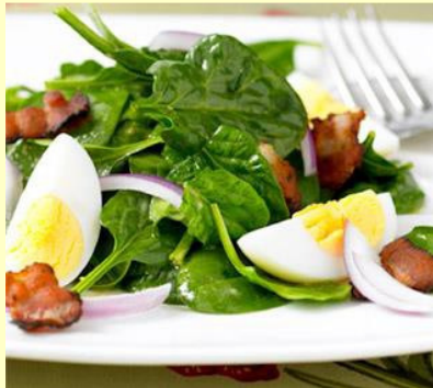
Bistro Salad-$3.49 per person Spinach with bacon, egg, red onion

Sesame Spinach Salad-$4.95 per person Baby spinach topped with wonton strips and red pepper, with a basil sesame dressing