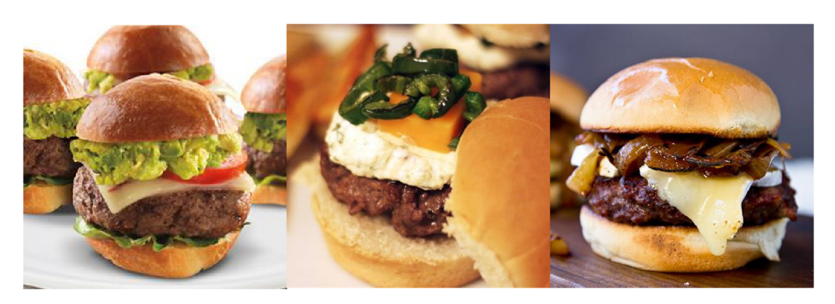
$8.95 per person

Start with a 100% Black Angus patty and a pillowy soft bun. Now choose 8 toppings: